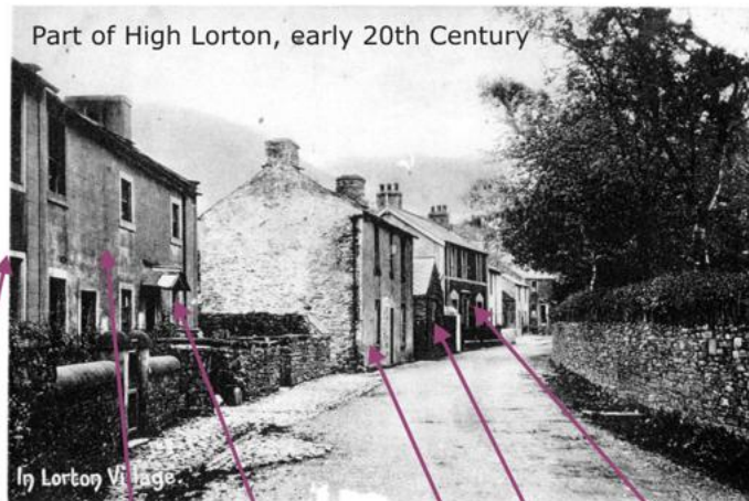
Part of High Lorton, early 20th Century