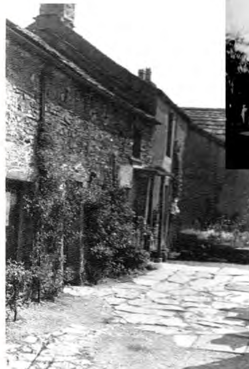
The future forecourt between the barn and the road.