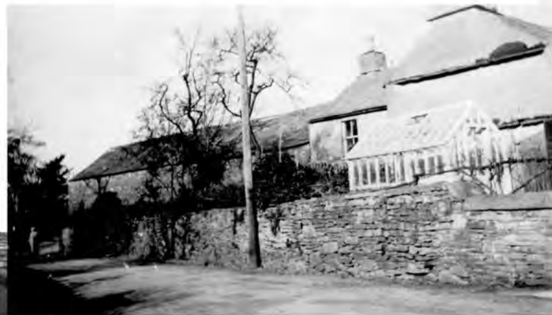
Midtown in 1935 from the south