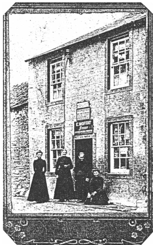
Corner House, High Lorton