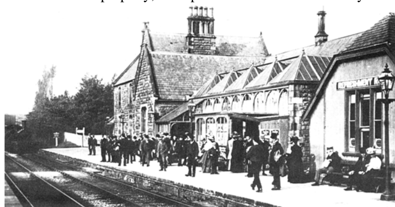
Cockermouth station around 1900

If the successive national Housing Acts between 1851 and 1930 have played any significant part in the development of either town, the records of any related action have either been destroyed or hidden from current knowledge. Both towns have clearly either benefited or suffered, depending on one's point of view relating to the character of the property, from piecemeal clearance of decayed and obsolete properties; but in what way this has