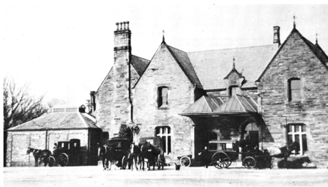
The front of Keswick station around 1900