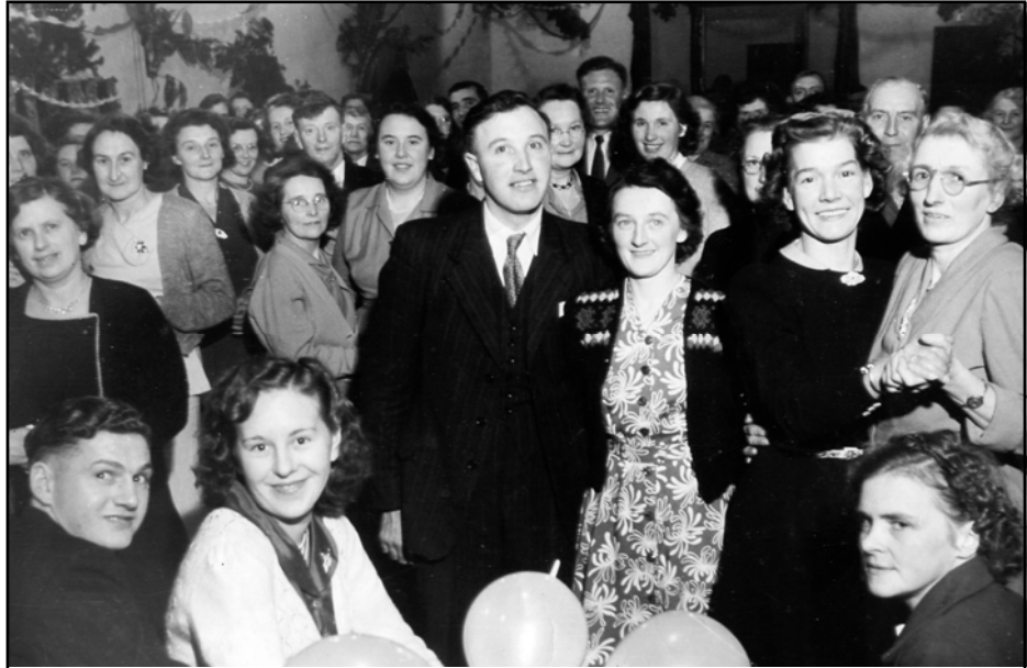
A WI dance in the 50s - do you recognise anyone?